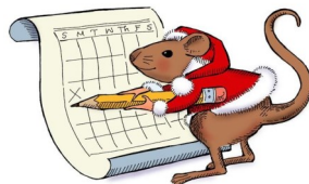
Christmas Eve Schedule

4:00pm - Christmas Eve Service (full choir, children's homily, communion, and Silent Night sung with candles)